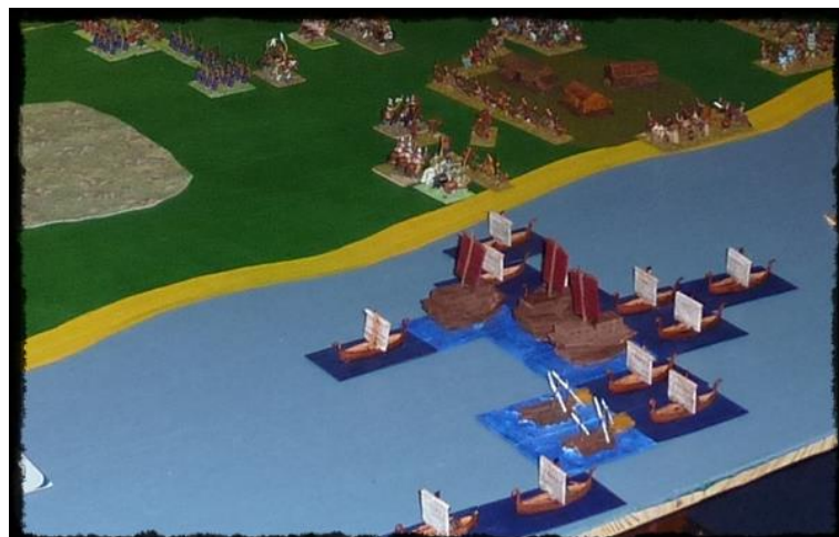
Neils Sung vs. Jürgens Vikings